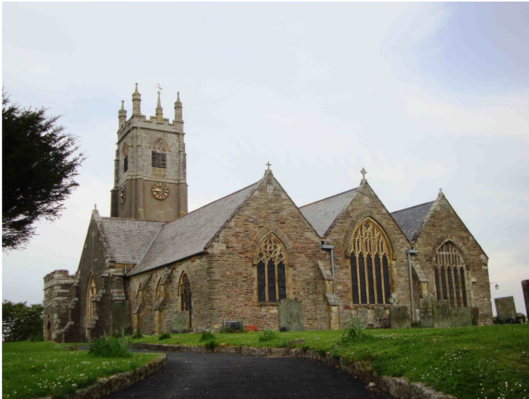
St Columb Major, 8 bells, 12-2-4 in F