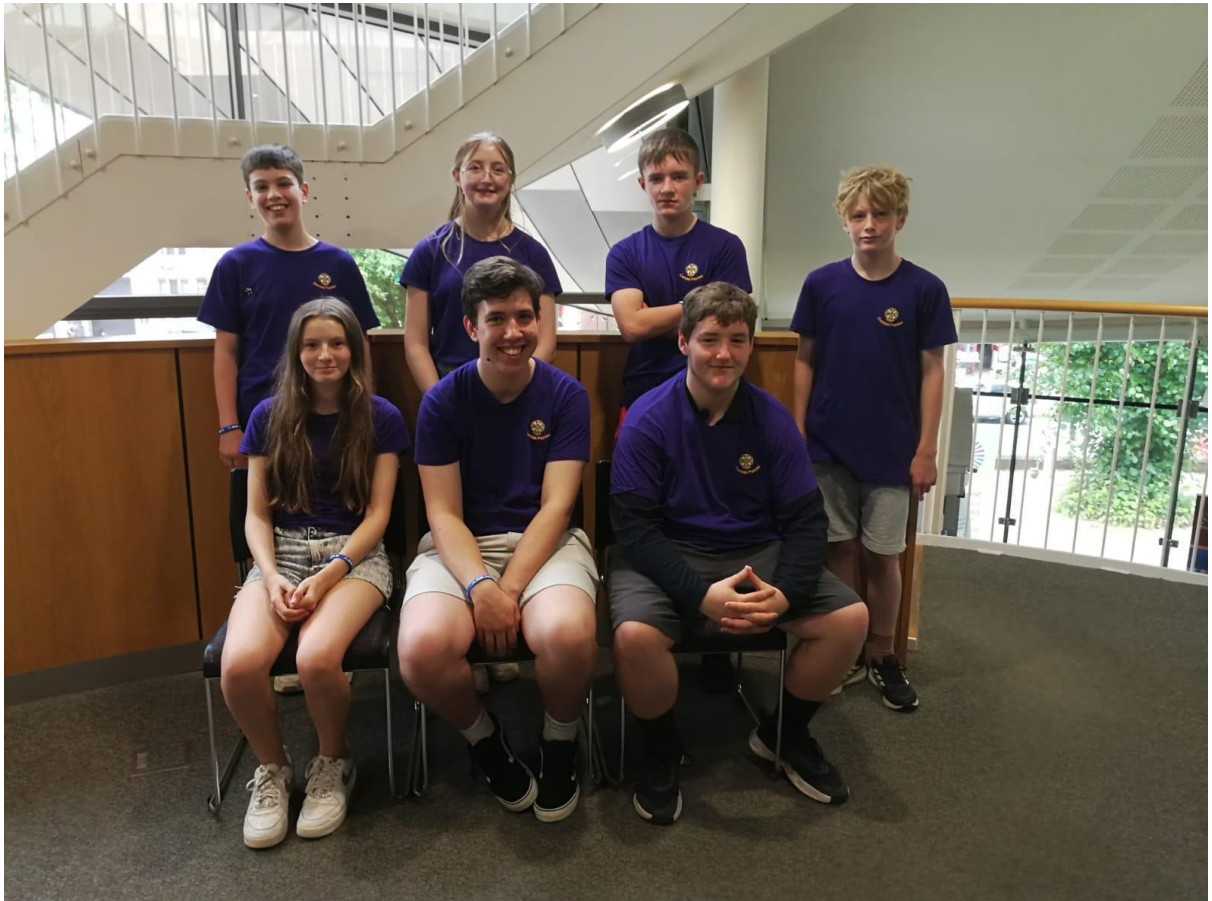
The Cornish Pasties team just after ringing their test piece in Birmingham