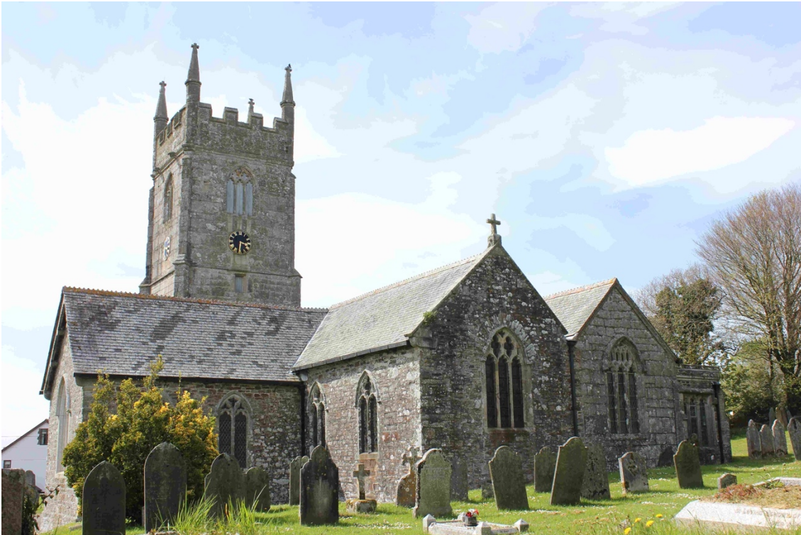
St Mellion, 6 bells, 7-3-7 in G