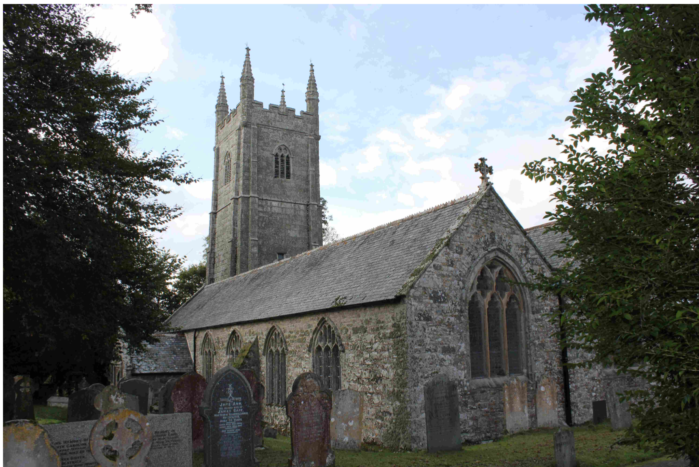
Ladock, 8 bells, 10-3-24 in G